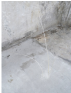
Jiyoong Chung Buds, 2024 epoxy dimension variable