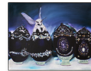
Marc Henry In This Interregnum a Great Variety Of Morbid Sym- ptoms Appear, 2023 Oil on Canvas 50 x 65 cm