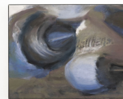
Marc Henry A Sweet Escape, 2022 Oil on Linen 50 x 65 cm