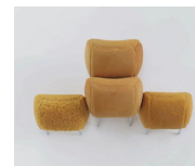
Jiyoong Chung Everything is Personal to Me, 2024 polypropylene head restraints collected from crushed cars and degraded by mealworms 31 x 81 x 38 cm