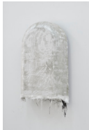
Noémi Barbaglia Etoui, 2019 / 2025 Glasfaser, Seide, Magnete, Kunstharz 90 x 60 x 40 cm