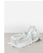
Noémi Barbaglia Still, 2024 Glass fiber and synthetic resin 200 x 100 x 95 cm